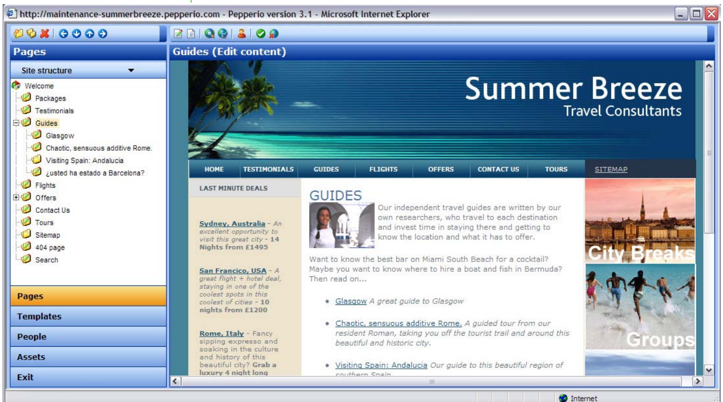
Figure 1: The Pepperio application - easily manage your entire site via a web browser without any technical knowledge